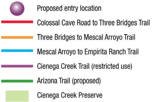
Figure 8-1 Proposed development within the Preserve