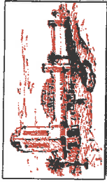
PROPOSED FAMILY ENTERTAINMENT CENTER