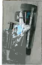
SOUTHERN ARIZONA RACEWAY