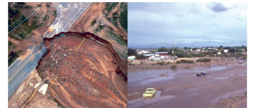
How would you know the pavement was gone if this road were covered with flowing water? At some point, saturated ground gives way and the pavement above it fails...often from the weight of a car. Don't put yourself, your passengers or rescue personnel in harm's way.

Complete short survey online at: surveymonkey.com/r/PCFC_survey