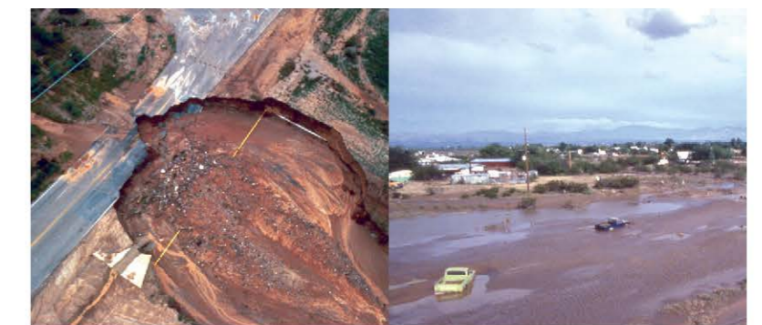
How would you know the pavement was gone if this road were covered with flowing water? At some point, saturated ground gives way and the pavement above it fails...often from the weight of a car. Don't put yourself, your passengers or rescue personnel in harm's way.

Complete short survey online at: surveymonkey.com/r/PCFC_survey