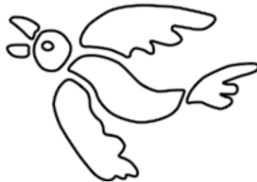
Bird • $800 Approximately 10" x 10"