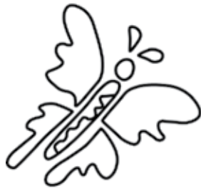
Butterfly • $600 Approximately 7" x 7"