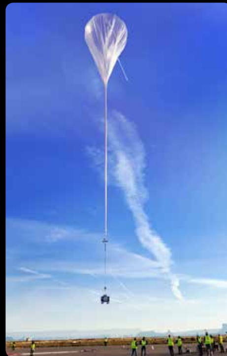
World View is the first tenant of ARC. The company uses high-altitude balloons to lift a variety of payloads to the stratosphere. The balloons will launch from Spaceport Tucson.