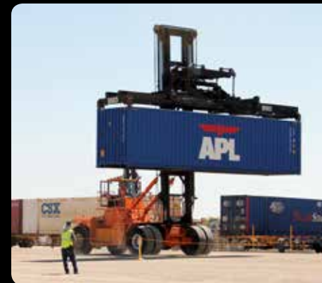
The Port of Tucson is the largest intermodal center in Arizona and highlights the area's flexibility in transportation. Rail, air, or truck services are available in a conveniently concentrated area.

Since 2009, One-Stop has worked with three other counties, area logistics companies in the Southern Arizona Logistics Education Organization and area colleges and universities to establish a regional logistics education program that resulted in 600 logistics-career credentials awarded.