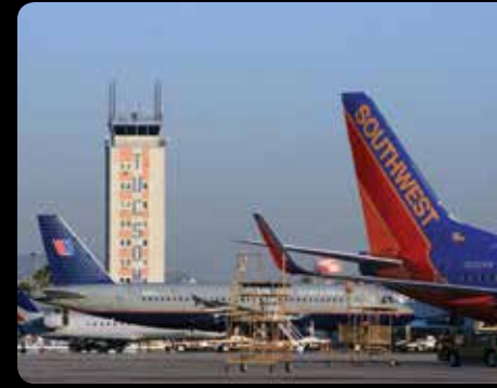
Tucson International has 3 active runways, the longest of which is over 11,000 feet. It has full 24-hour port of entry facilities for both cargo and passengers, including customs and immigration services.