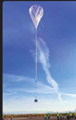
World View is the first tenant of ARC. The company uses high-altitude balloons to lift a variety of payloads to the stratosphere. The balloons will launch from Spaceport Tucson.