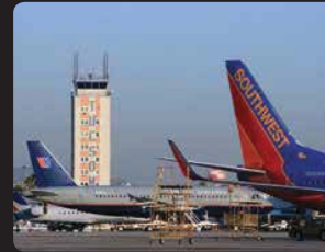
Tucson International has 3 active runways, the longest of which is over 11,000 feet. It has full 24-hour port of entry facilities for both cargo and passengers, including customs and immigration services.