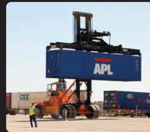
The Port of Tucson is the largest intermodal center in Arizona and highlights the area's flexibility in transportation. Rail, air, or truck services are available in a conveniently concentrated area.

Since 2009, One-Stop has worked with three other counties, area logistics companies in the Southern Arizona Logistics Education Organization and area colleges and universities to establish a regional logistics education program that resulted in 600 logistics-career credentials awarded.